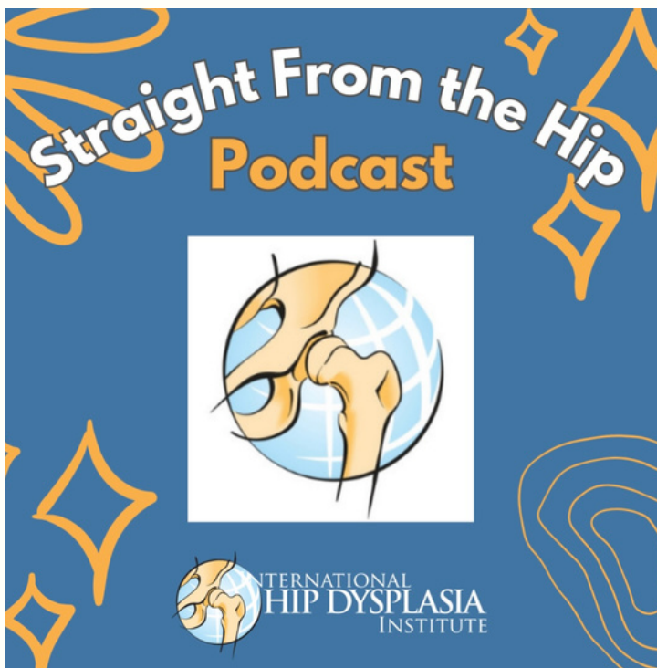
The New IHDI Podcast: The First Episode Premiered on December 20, 2023 (more on page 2)